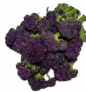
Broccoli Purple Sprouting Order Code: BROCPUR