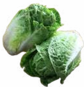
Lettuce Little Gem Order Code: LETTGEM